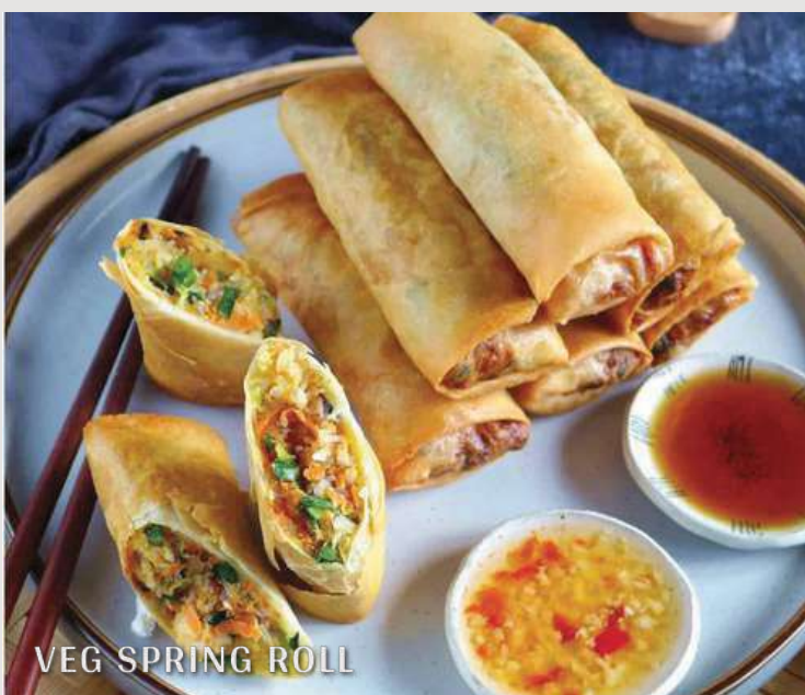
VEG SPRING ROLL